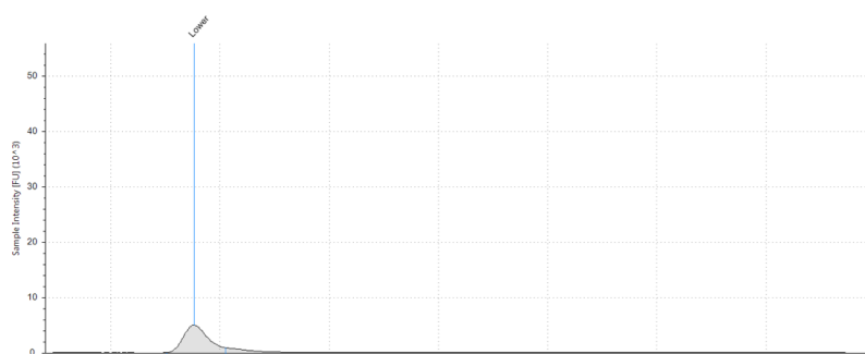
Figure 2: Agilent TapeStation image of 1 \mu\text{l} of total RNA sample.

The quality of the RNA is measured using an Agilent TapeStation Instrument with the RNA screen tape (Catlog Number 5067-5576).